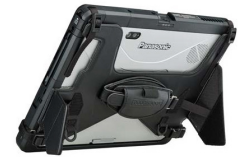
(tablet sold separately)

(Not compatible with any tablet dock that has a tablet with a quick-release SSD or with Gamber-Johnson Tablet Vehicle Dock when tablet is equipped with long life batteries)