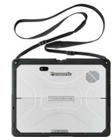
(tablet sold separately)