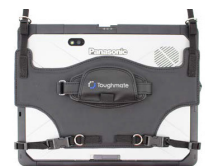
(tablet sold separately)

(Not compatible with Gamber-Johnson Tablet Vehicle Dock when tablet is equipped with long life batteries)